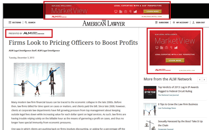
LOGO & BANNER ADVERTISEMENTS ON ARTICLE PAGE